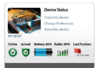
See the status of your device online in addition to tracking and other features.

Ensures operation if your watercraft's battery is disconnected