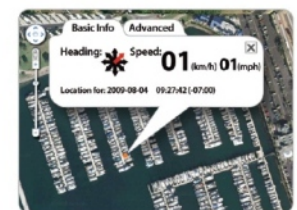
Real-time GPS tracking tells you where your watercraft is at anytime.