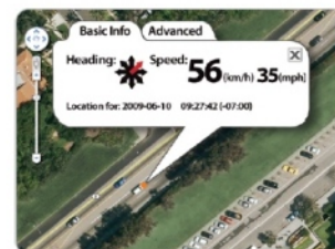
Real-time GPS tracking tells you where your vehicle is at anytime.

User interface, graphics, and features subject to change.